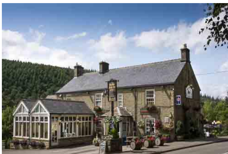
Yorkshire Bridge Inn

Also in Bamford are bed-and-breakfast accommodation and other residentially-based businesses (e.g. mobile carpet-cleaning, beauty treatment, gardening, building repairs, decorating, electrician). A mobile fishmonger visits Bamford once weekly, stopping on Taggs Knoll.