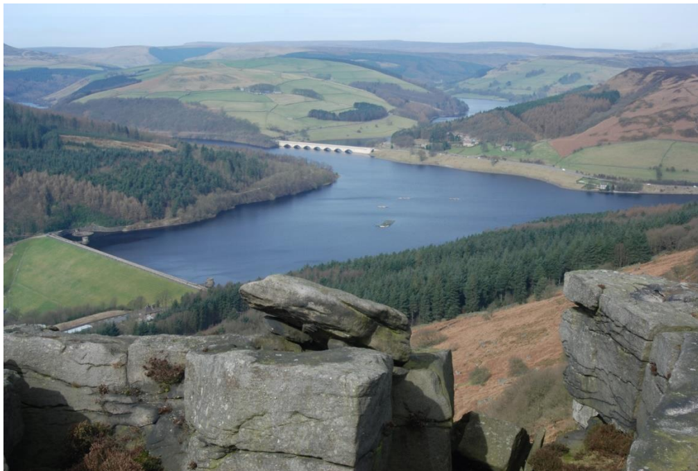
Ladybower reservoir from Bamford Edge

The Peak District National Park Authority , based in Bakewell, is responsible for the planning system and for conservation of the environment. There are 30 Members of the Authority, 16 appointed by the local County/District/Borough councils and 14 by national Government; six of those 14 are parish councillors.