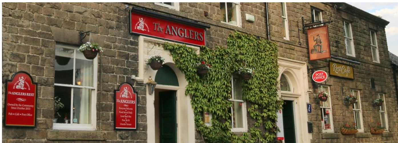
The Anglers Rest

The following local businesses would be very pleased of your custom.